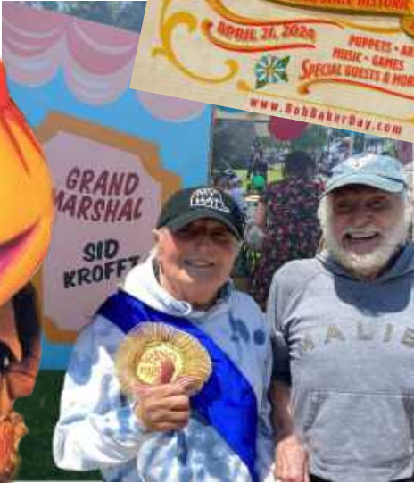
Grand Marshal: Sid Krofft and the legendary Dick Van Dyke