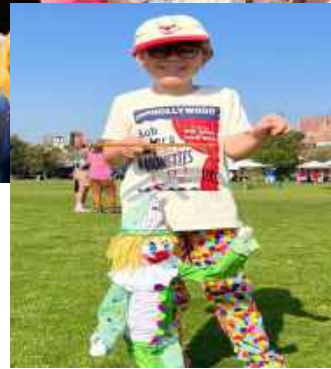
A young puppeteer