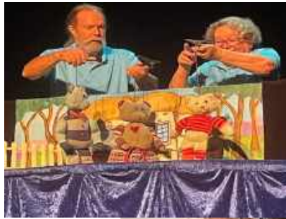
Magical Moonshine Theatre Puppy-locks and the Three Bears