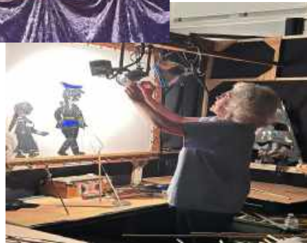
Oregon Shadow Theater - The Green Bird