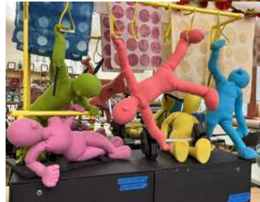
Tabletop Puppets with Heather Gobbee