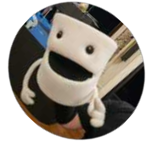
Social Media for Puppeteers with Grant Baciocco