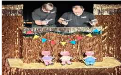
Fratello Marionettes - Carnival of the Animals