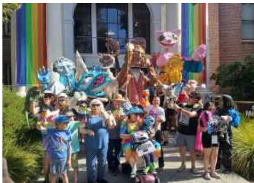
Group photo after Saturdays Parade